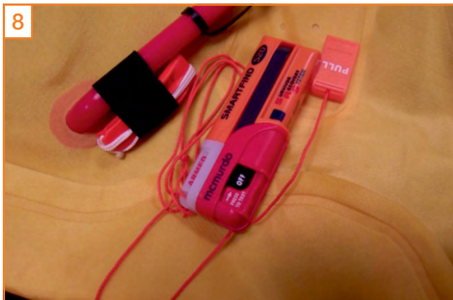
Re-packing the lifejacket. Lay the excess lanyard and the orange tab to the side of the unit when packing the lifejacket. Follow the packing procedure as outlined in the user manual. Your S20 unit is now fitted and armed inside your lifejacket, on inflation you S20 will automatically activate and a signal will be transmitted.