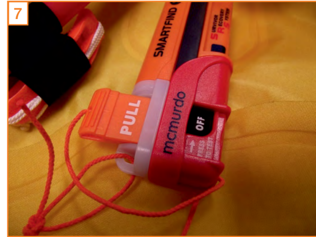
Arming the S20. To arm the S20 unit remove the orange tab from the unit. Lift the right side slightly & push left with your finger.