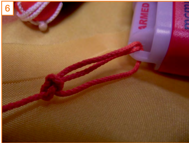
Secure with bowline. Secure the end of the excess cord to the white section with a bowline.