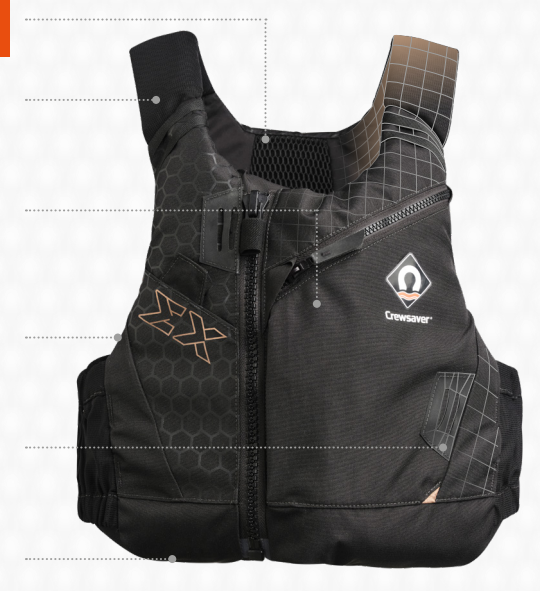
Buoyancy aid in focus: The Pro 50N EX

Internal Grip Strips to prevent garment ride up