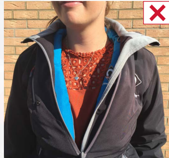
Wear clothes over the top of your lifejacket