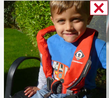
Wear an incorrectly fitting lifejacket