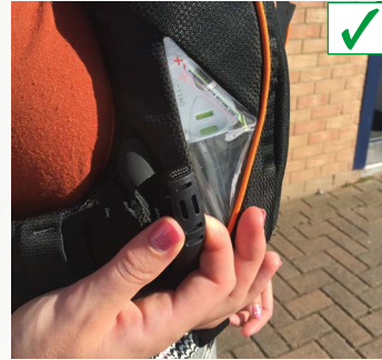
Understand how your lifejacket works