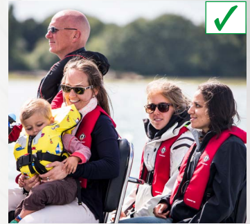
Ask the skipper the last time they had their lifejackets serviced