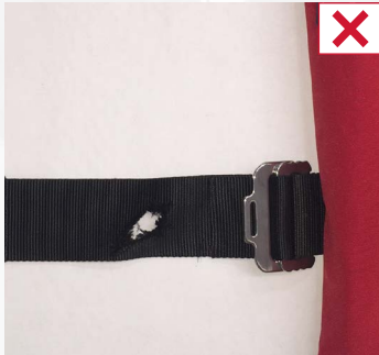
Wear a damaged lifejacket