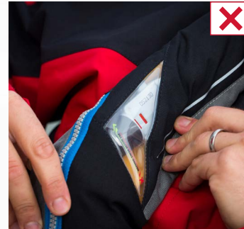
Wear a lifejacket that shows red status indicators