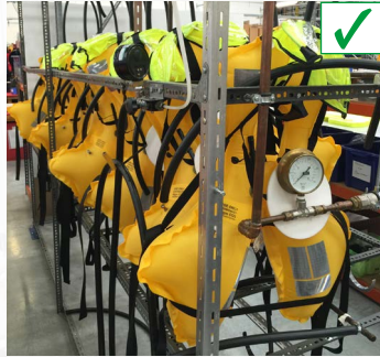
Get your lifejacket serviced at a fully approved service station