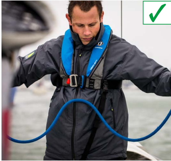
Wear your lifejacket